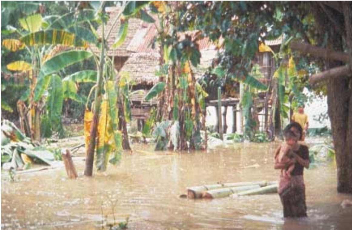
Future global warming may lead to fewer and less intense El Niño events. (Andrus, 2002)

also reports there has been a decrease in the annual number of thunderstorms with hail over the period of record, and there has been a decrease in the frequency of storms producing precipitation greater than 20 mm.